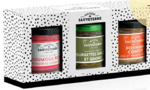
Assortment of 3 vegetable spreads