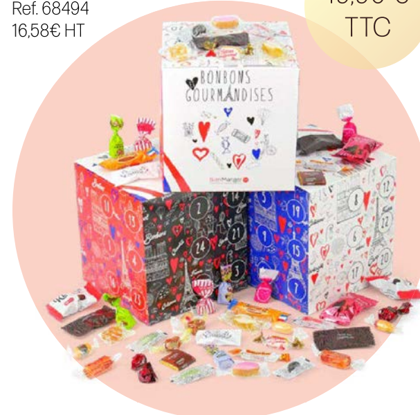
Sweets and treats from France