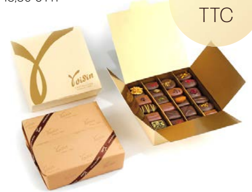
Prestige chocolate box Voisin - 250g