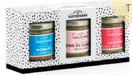
Assortment of 3 fish terrines

Ref. 25753 (red) Ref. 71094 (yellow) Ref. 71891 (blue) 9,50 € HT