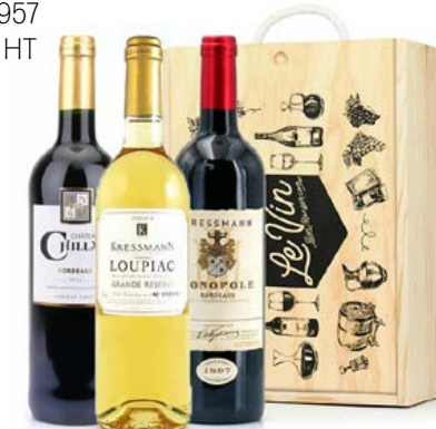
3 Bordeaux wines wooden box