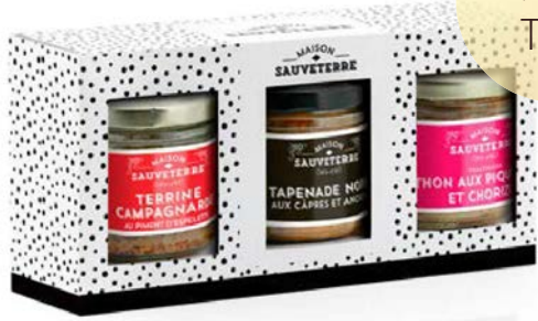
Assortment of 3 spreads (meat, fish, vegetables)