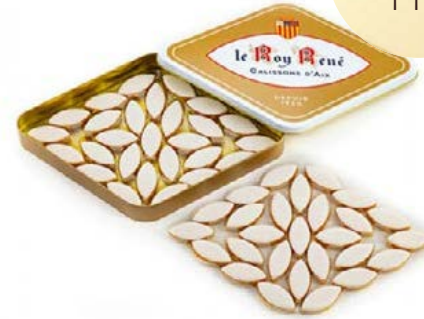
36 Calissons d'Aix Le Roy René