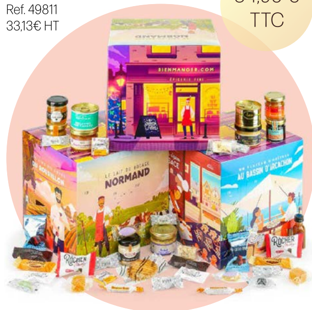
Terroirs de France (sweet and savoury)