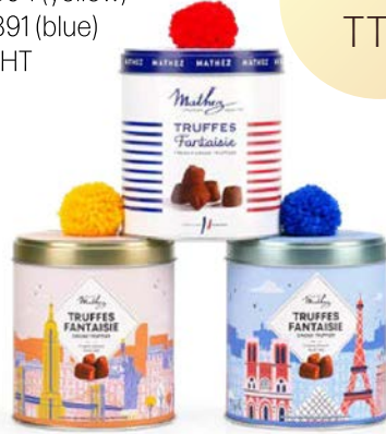
Metal box of Mathez fancy cocoa truffles (250g)