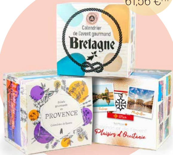
French Regions (Brittany, Provence, Occitania) (sweet and savoury to share)