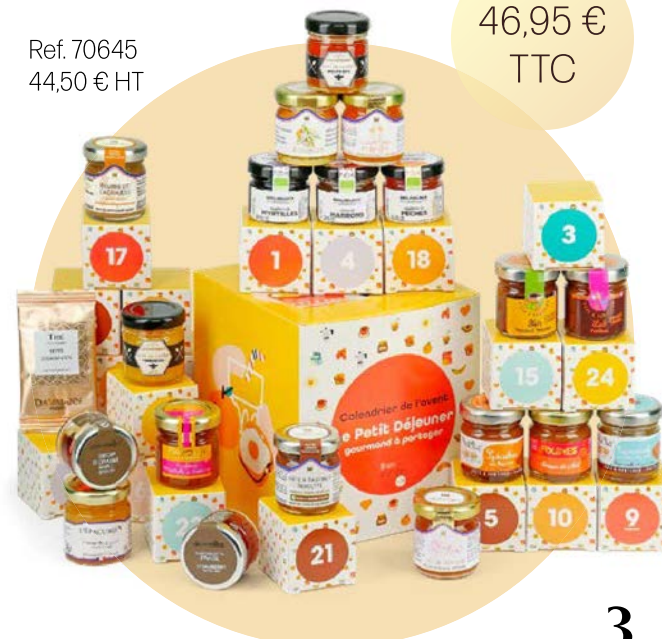
Breakfast jams and spreads