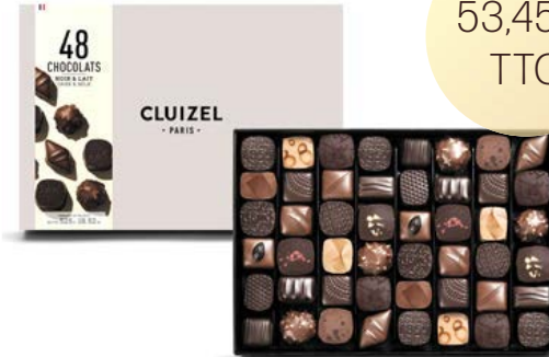
48 black and milk chocolates box Michel Cluizel - 525g